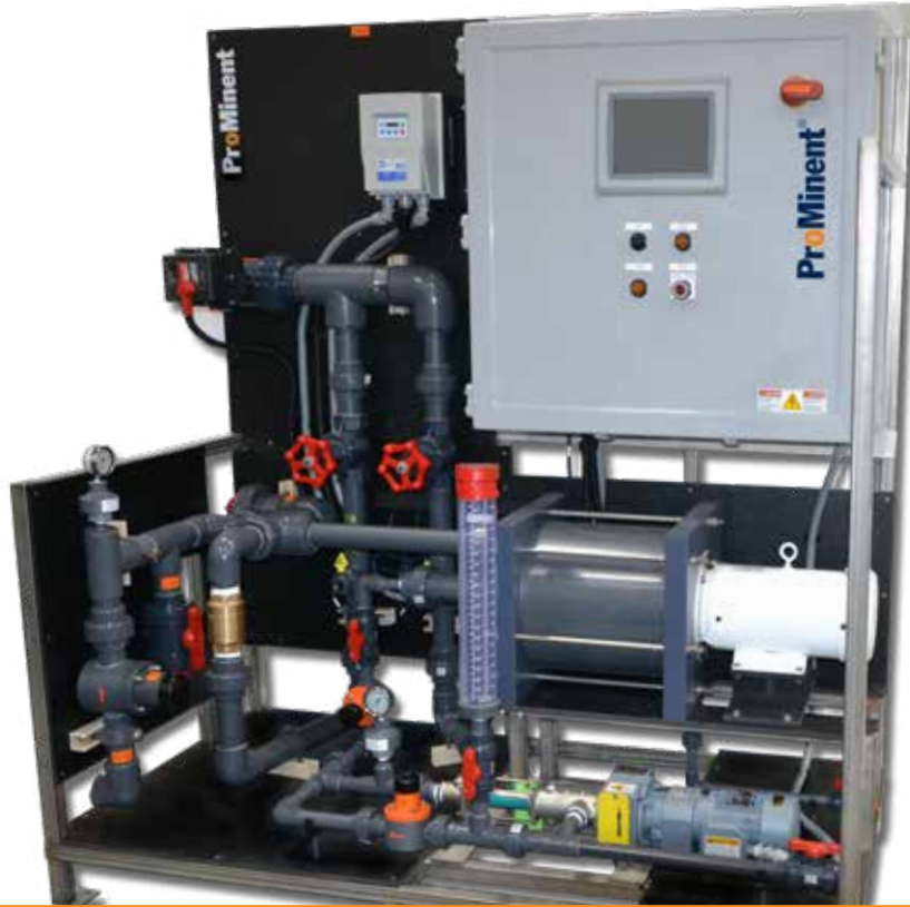
Example of ProMix-L

Designed for Maximum Polymer Activation and Performance!