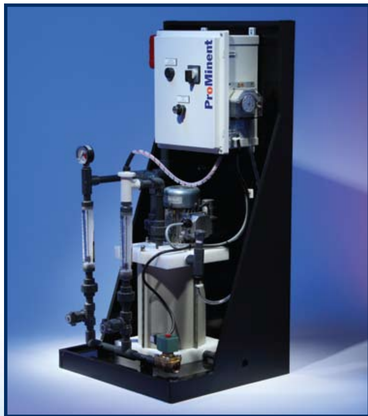
ProMix Blending System/S-Series