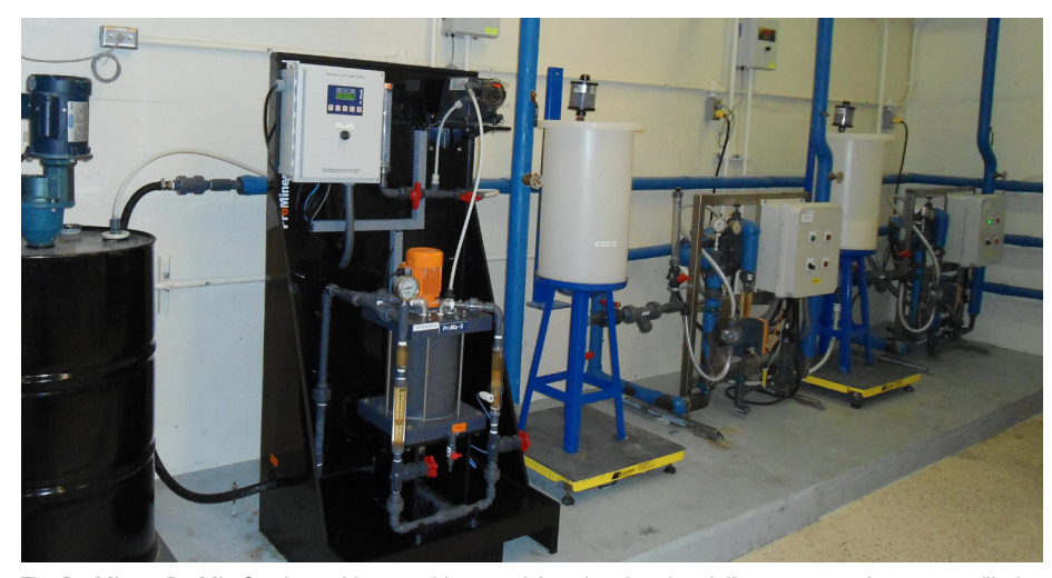
The ProMinent ProMix-S unit provides a multi-zone mixing chamber that delivers a tapered energy profile for hydrating and mixing polymer to a homogeneous and fully activated solution. To the right of it is the plant's former single zone system, requiring day tanks that feed from the 55-gallon supply drum.

In addition, the system was maintenance intensive, including frequent ejector replacement at $300 for each failure. The mixing units had problems with plugging, and pump parts require frequent replacement. Maintenance personnel had to perform a complete take-down of the system every month, including the mixing units and pumps (ball valve and check valve replacement), pump recalibration and day tank clean-out. The plant spent more than $1,500 a year on parts for the existing system, and more than $2,000 in estimated staff labor to maintain it.