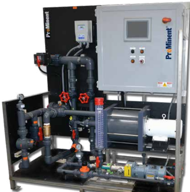
Example of ProMix-L

Designed for Maximum Polymer Activation and Performance!