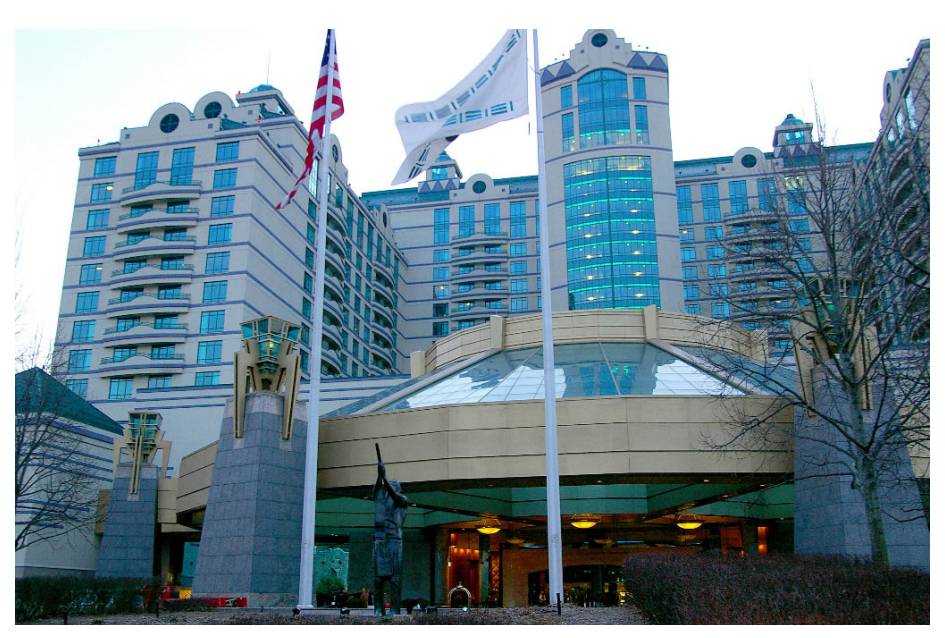
Foxwoods Resort Casino is a hotel-casino on the Mashantucket Pequot Indian Reservation. Together with the MGM Grand at Foxwoods, it comprises of 4,700,000 sq ft (440,000 m2) of space.

out," says Plant Manager David Drobiak. "We run the centrifuges every day – two shifts per day during the week and one shift per day on weekends. If we had a larger holding area for our biosolids, we wouldn't have to run the centrifuges as much as we do, but we waste 40,000 to 50,000 gallons a day," Drobiak says. "With only 150,000 gallons