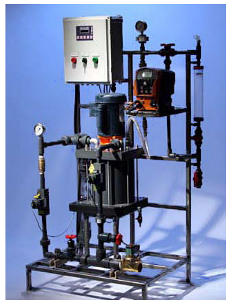
The ProMix M is easily operated and adjusted using the touch screen display on the control panel. The unit maintains desired concentration based on primary and secondary dilution water flow.

The ProMix system is engineered to meet liquid polymer feed applications utilizing diaphragm or progressive cavity pump technologies. It also provides 4-20mA input to pace the pump as well as provides connections for Ethernet communications and datalogging.