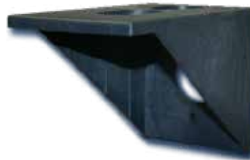
Wall-mounted Pump Shelf