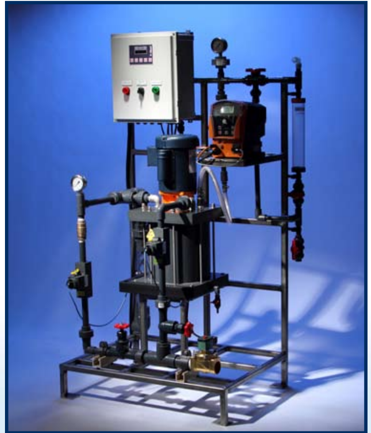
ProMix-M System (7746546)