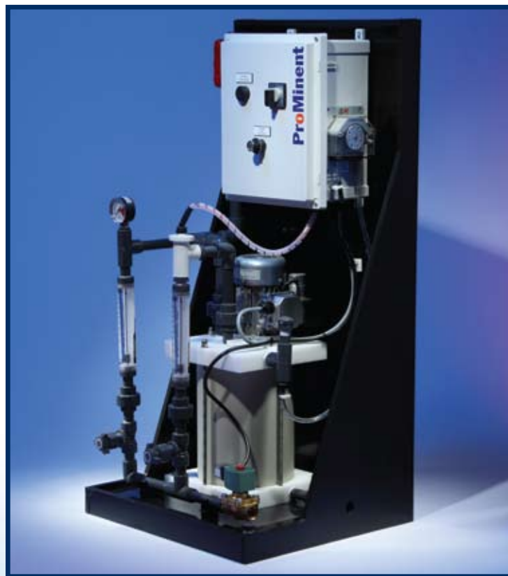
ProMix-S Blending System