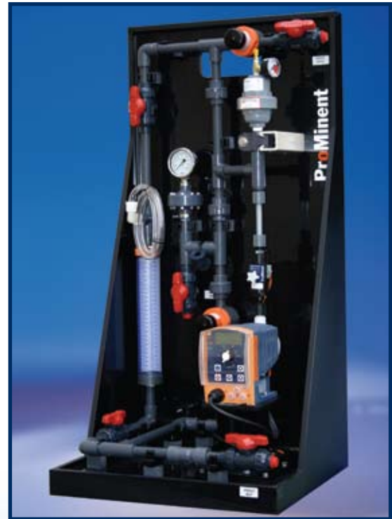
Pre-engineered Single Pump Floor Mount System