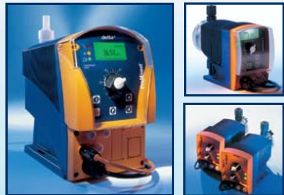
delta, gamma/L or beta solenoid pumps for SS1