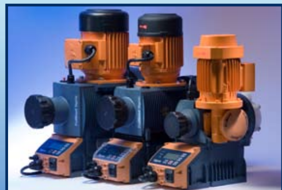
Sigma/1, 2, or 3 motor pumps for MM1