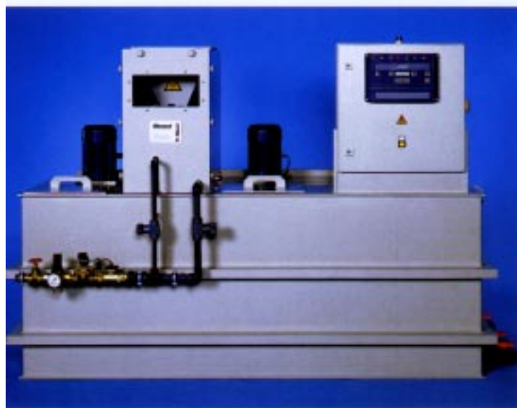
Proven technology: The Ultromat® AT 1000/96 Triple Compartment Plant

The powder is conveyed from a feed hopper into a mixing assembly. After wetting it enters the preparation compartment of a triple compartment tank where it is diluted to the required solution. This solution flows into the maturing compartment and from there into the storage compartment.