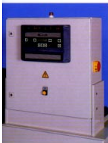
dependable microprocessor control: Ultramat® plant

When the levels are low, a sensor triggers the lower level-switch in the storage chamber. This activates the batching process. The controller measures the water quantity. At the same time the controller calculates the necessary polymer quantities – according to the concentration desired – and adjusts the Dry Feeder. The concentration of the polymer solution is maintained at a constant level, therefore, even when water flows fluctuate.